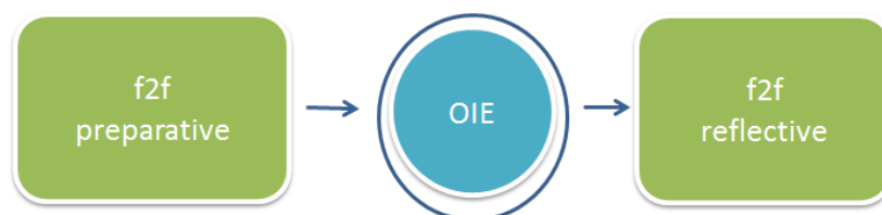
Figure 2. Relationship between the f2f and OIE modes in the six BL courses

NTE-teacher puts it. However, the OIE and f2f facets of the courses are tightly interwoven. The following section shows that the role of the f2f sessions in all six courses is to prepare for and/or reflect on the OIE sessions (see figure 2). It is interesting to note that this applies regardless of their timely sequencing, either in rather regular intervals (NTE, 21F.303, EL1, IRL), in separate blocks (SE), or in a combination of both (EL3). The particular types of activities included in each mode nevertheless depend on the main focus of the course, for example, language or intercultural awareness.