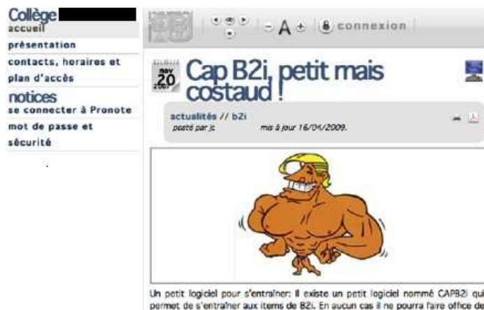
Illustration 4: Portal of a public collège

Several other kinds of portals do exist on the web, developed by schools, by associations, publishers and even by individual teachers. A huge diversity was observed between them, including regarding gender. For example, Illustration 3 has been found on the B2i portal of a public collège .