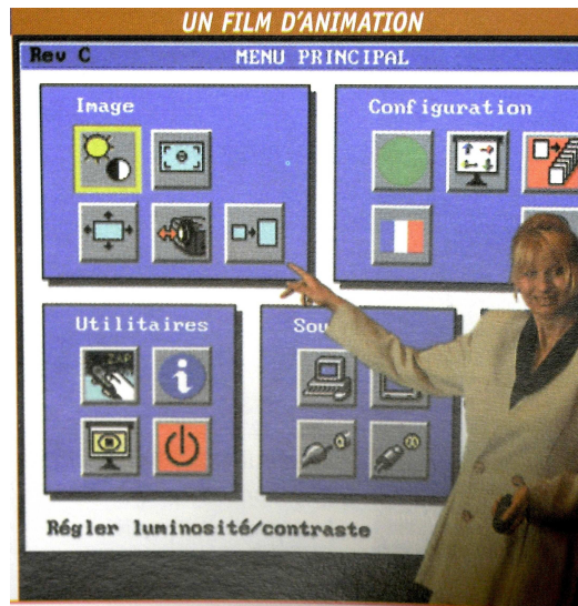
Illustration 3: Cliquet & al, 1998, p. 88.

For their part, women are rather represented in contexts linked to communication and to the new literacies defined by Leu, Kinzer, Coiro, & Cammack, (2004).