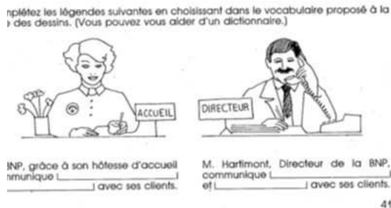
Illustration 1: Bonnet G., al.. (1985) p. 41. the man is an executive and the woman is employed at the reception desk

Our analysis of a sample of textbooks in Technologie from 1985 to 2009 shows that men are more often represented in pictures than women. In this sample, we found 257 pictures representing men in a professional context, 82 pictures representing women in a professional context and 45 representing both men and women in professional context. Moreover, when women are shown they are significantly more represented with a differentiated social status : women tend to be consumers or employees whereas men tend to have leading responsibilities. This can be seen in the first technologie textbooks and even in some more recent ones.