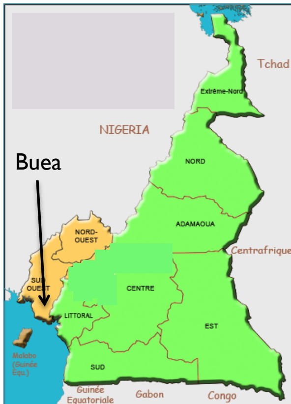
Figure I. Geographical, historical and linguistic situation of Cameroon