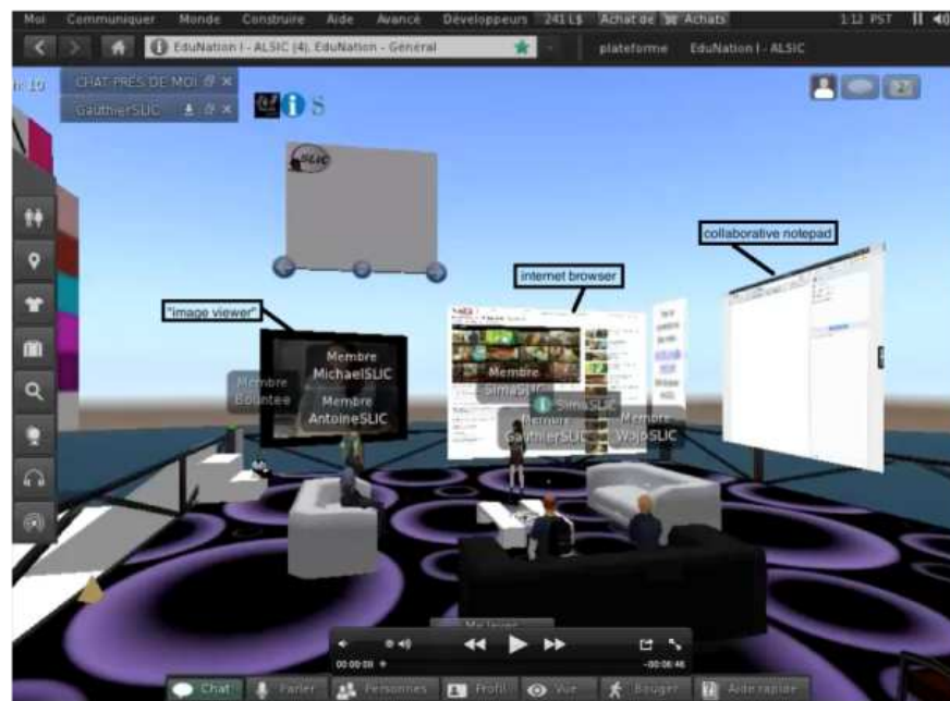
Figure 2: Screen capture of the SLIC platform where the groups met

access either in or from SL to Google documents, a web browser, an SL chat tool, a collaborative notepad, and an image viewer. They were also able to leave the SLIC platform to visit other SL locations. Additionally, Moodle was used as a resource platform and for asynchronous exchanges within and between groups.