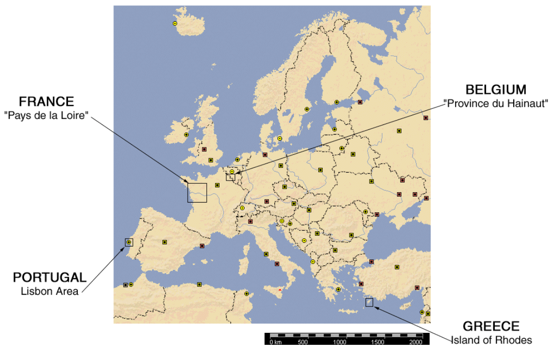
Fig.1: Location of the four national networks of schools involved in the ModellingSpace project – Map of Europe

The MS project partners have all selected teachers who teach in schools within the particular geographic area of their university (see the European map drawn in Fig.1). This offers the researchers easier access to the schools. It makes indeed easier the provision of assistance where and when needed as well as the organisation of meetings between the members of each national network. These geographic areas are: the “Province du Hainaut” in Belgium, the “Pays de Loire” in France, the island of Rhodes in Greece and the Lisbon area in Portugal.