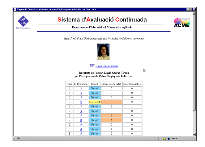
Fig 3. Student page.

Each exercise number is linked to the Exercise page.